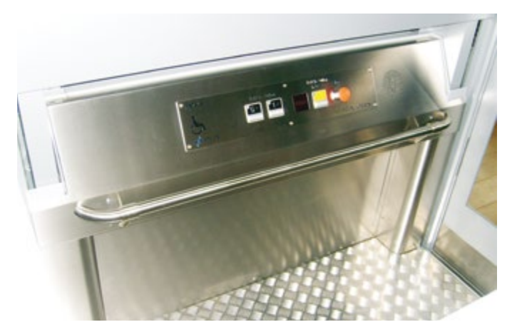
Stainless Steel (floor shown is a further additional option)